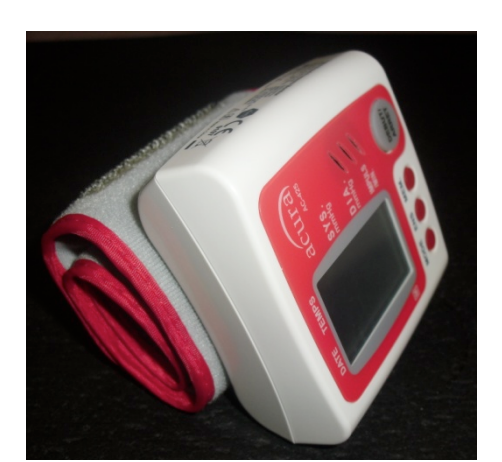
Figure 3. Audible tension meter

These there blind user based materials were used during the study. These materials are very popular, widely used in the country and last version products according to experts about blindness. The common property of selected materials is being audible machines. You may hear the measured data by pushing on one button. For instance, audible tension meter works automatically after attaching the arm. It presses your arm and speaks loudly the degree of your tension. Similarly, audible scale speaks the weight of things whatever you put on. Blind user only needs one or two testing process to understand how to get the value.