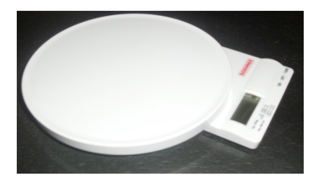
Figure 1. Audible scale

There were three materials which the student was used; namely, audible scale (figure 1), audible thermometer (figure 2) and audible tension meter (figure 3).