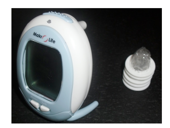
Figure 2. Audible thermometer