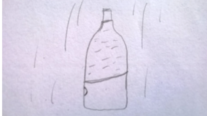
Figure 4. A student's drawing that illustrate an alternative explanation of the absence of water jet in free fall

explanation for such a phenomenon: The water jet doesn't flow out in free fall, because the water goes up, placing itself above the hole (Figure 4).