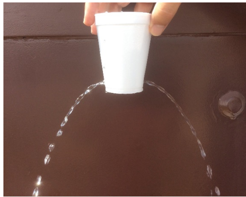
Figure 1. Two jets flowing out of a plastic cup

Wilson, Buffa and Lou (2007, p. 253) present a photo of a plastic cup from which two jets of water flowing out. Their photo is similar to the one in the Figure 1.