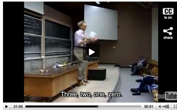
Figure 3. Prof. Lewin is performing a low-tech classroom demonstration of weightlessness of a gallon of water in free fall

The second type of weightlessness demonstration is a high-tech one, showing that two sensitive electronic balances, in free fall, don't register a weight of an attached object. The balances were designed and made at the MIT. It is very important to stress that, before performing both type of demonstrations, Prof. Lewin tells students what they are going to observe. In the third part, students are shown videos clips about weightlessness experiences of persons on board of a plane moving along a parabolic path with engines off. As Prof. Lewin's way of teaching is to do and tell everything, students are not given any opportunity for active learning of the concepts of weight and weightlessness.